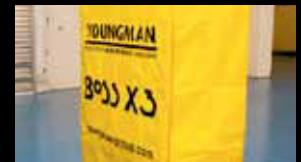
Heavy Duty All Weather Cover